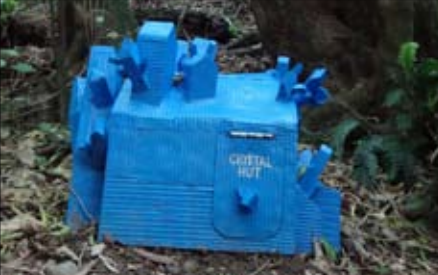
For other installations around Wellington this summer see: www.Keminiko.com/miniature hikes